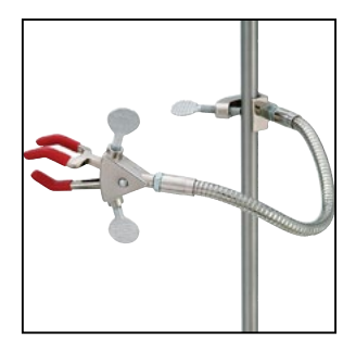
Ultra Flex Support Kit