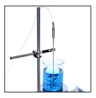
Support Rod and Clamp Kit