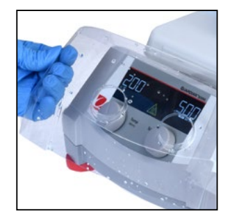
In Use Cover