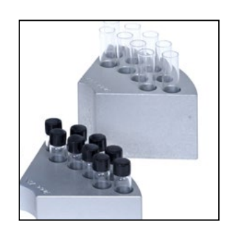
Vial and Test Tube Blocks