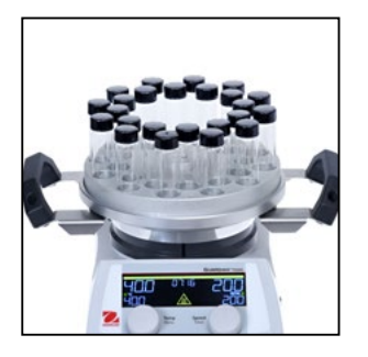
Base Plate and Handles