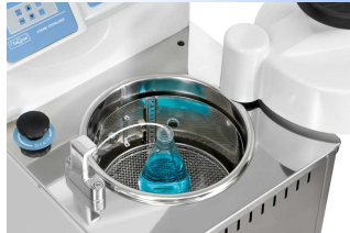
Heart probe (option)