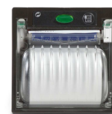
Table top printer

It prints number of program, number of cycle, temperature, date and hour of the run. Error messages are also printed.