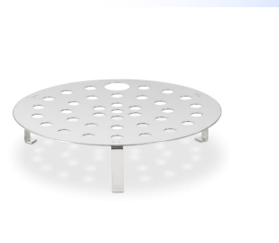
Heater cover tray