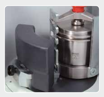
For optimal balancing the counterweight of the PM 100 can slide up an inclined guide rail

In this way the PM 100 ensures a quiet and safe operation with maximum compensation of vibrations even with the largest pulverization forces inside the grinding jars and therefore can be left on the bench unsupervised.