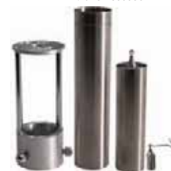
Part No. 1000997