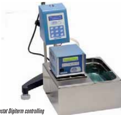
Immersion thermostat Digiterm controlling temperature of viscometer.