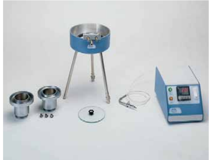
Heated cups with threaded base, can be connected to a water bath or to a temperature regulator Electemp.

Support stand with adjustable level. Part No. 7001021