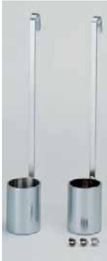
Flow cups with handle. Models DIN 53211 N° 4 and Ford ASTM D-1200.

Suitable for measuring kinematic viscosities from 5 to 700 cSt, model dependent. Metallic cups, chrome finished and calibrated.