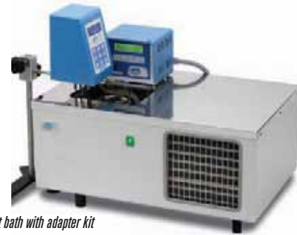
Frigiterm thermostat bath with adapter kit Part No. 1001625, fitted with a rotary viscometer.

Certified known viscosity standards, suitable for calibrating rotary viscometers. Comes complete with official certificate.