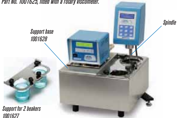
Support for 2 beakers Part No. 1001627