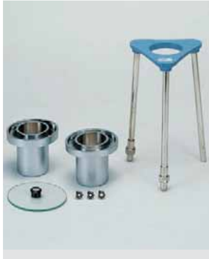
Flow cups. Standard models.