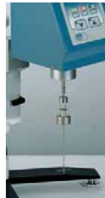
Part No. 1000988