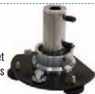
Part No. 1000996