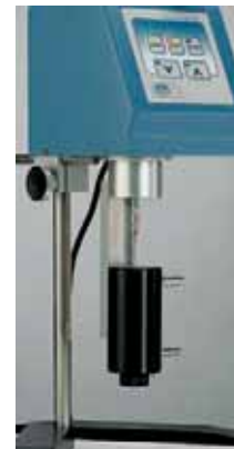
Part No. 1000986