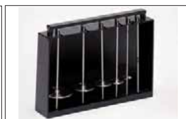
Rack of standard spindles R2, R3, R4, R5, R6 and R7: Suitable for model R.