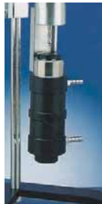
Part No. 1000985