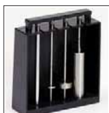
Rack of standard spindles L1, L2, L3, L4 : Suitable for models L.