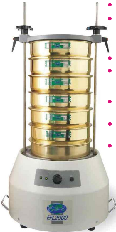
Sieves supplied separately

For sieves up to 315 mm & 12 in diameter sieves