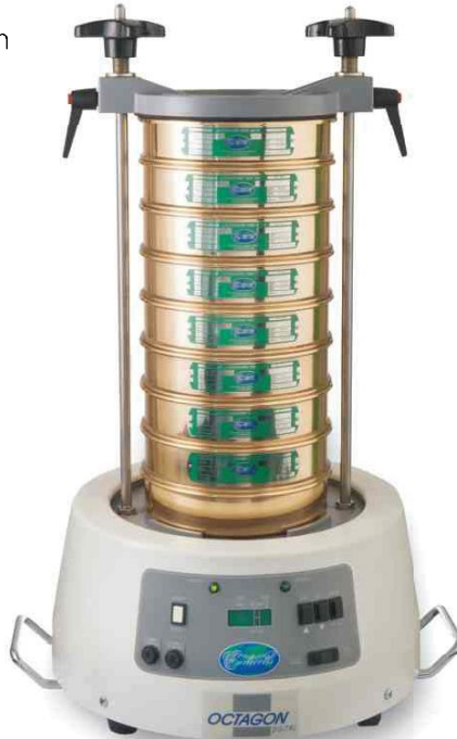
Sieves supplied separately