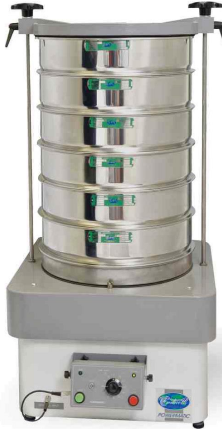
Sieves supplied separately

For 300, 315, 350, 400 & 450 mm, 12 in & 18 in diameter sieves