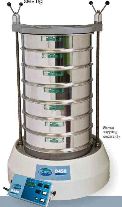
Sieves supplied separately

By utilising the same dynamic control panel as the D200 the D450 offers outstanding control features. The complete vibration system has been built to handle the sample weights involved with larger diameter sieves eliminating the problems involved with lighter weight machines. These two features combine to give an extremely high performance shaker in the 450 range.