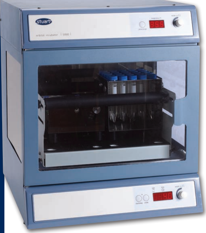
SI600 and SI500

Both Incubators have a versatile clamping system which secures most sizes and mixtures of flask up to 1 litre on the SI500 and 2 litre on the SI600. Typically, the SI500 platform will accommodate the following Erlenmeyer flasks: 12 x 250 ml, or 9 x 500 ml or 6 x 1000 ml while the SI600 can accommodate the following: 6 x 2000ml, 9 x 1000ml or 15 x 500ml.