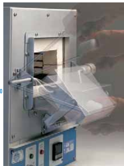
Image of the flap door system in operation.