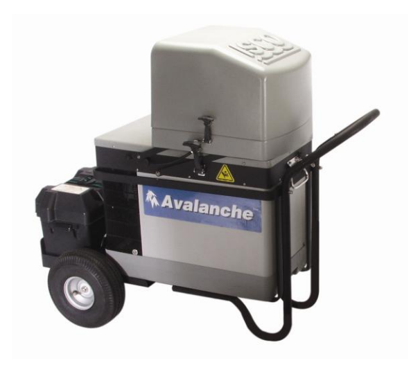
Optional mobility kit includes pneumatic tires for ease of transport over rough terrain, and a convenient battery platform.