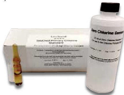
ValidCheck Chlorine 1,5 mg/l Code: 48 10 55 10

For checking each chlorine meter. This standard is easy to handle. US EPA Methode 334.0