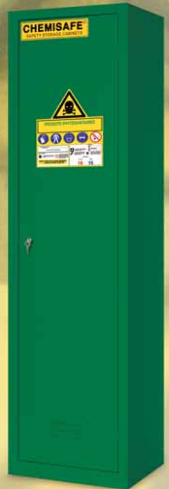
PHYTO 600 - Code CS600V