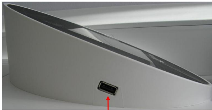
USB A plug for USB memory sticks (Biochrom Libra S50, S60, S70 & S80 only)