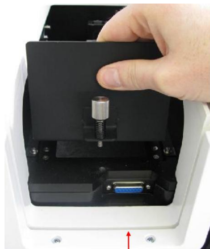
Internal accessory connector